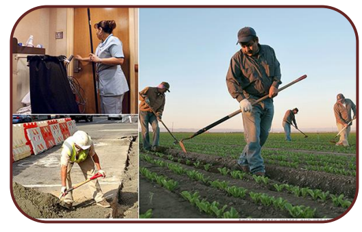
Labor trafficking in the hotel, construction and agriculture industries USA

USCSAHT is a collaborative, faith-based national network that offers education, supports access to survivor services, and engages in advocacy in an effort to eradicate modern-day slavery. Bon Secours USA belong to this organization and are one of the sponsors of the monthly newsletter USCSAHT produces. You can access the newsletter here: <a href="https://www.stopenslavement.org">www.stopenslavement.org</a>