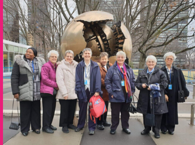
Left: UNANIMA International Board Meeting - February 2020