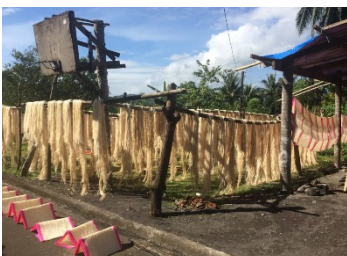
Drying of Abaca fibers.

Fiber from a relative of the banana tree could replace plastic in millions of face masks and hospital gowns the world is making to fight the coronavirus. Abaca – a fiber from the Philippines – is as durable as polyester but will decompose within two months.