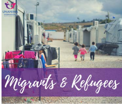
Migrants & Refugees