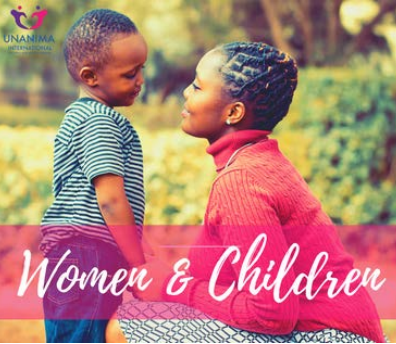
Women & Children