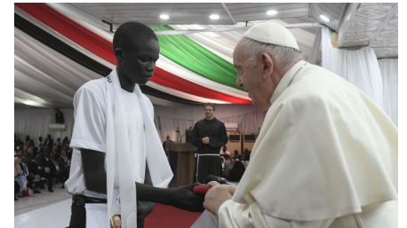
Pope Francis meets a boy in an IDP camp in Juba.

More than 4.3 million people in South Sudan are estimated to need humanitarian assistance — the majority of whom are displaced or refugees.