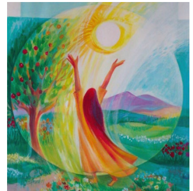
"Circle of Summer" © Mary Southard, CSJ

Where is God's Spirit inviting you to grow?