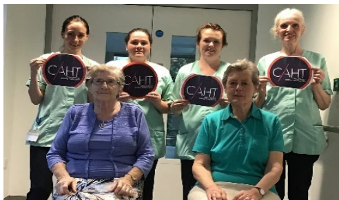
Addressing Human Trafficking, Cork 2019