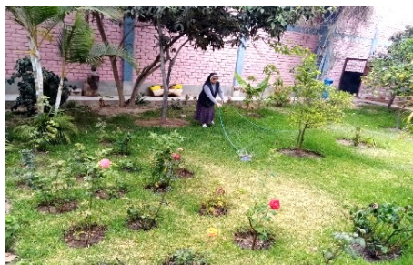
Caring for Earth. Peru 2022

"As Sisters of Bon Secours the struggle for a more humane world is not an option; it is an integral part of spreading the gospel and involvement in justice issues is an important part of who we are as Sisters of Bon Secours." (CBS Constitutions)