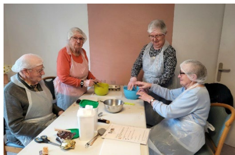
Education for a Sustainable Lifestyle Cooking workshop with local products. (above) Teaching gardening to children (left) Vendome, France 2023