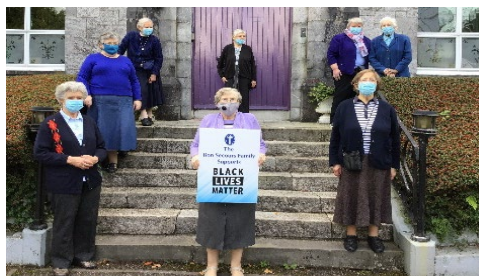
Supporting Black Lives Matter – Addressing Racism Cork, Ireland 2020