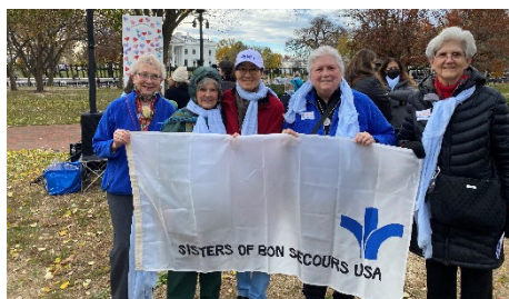
Public Witness for Immigration Reform Washington, DC 2019