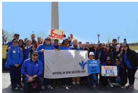
March for Our Lives against Gun Violence Washington, DC 2018